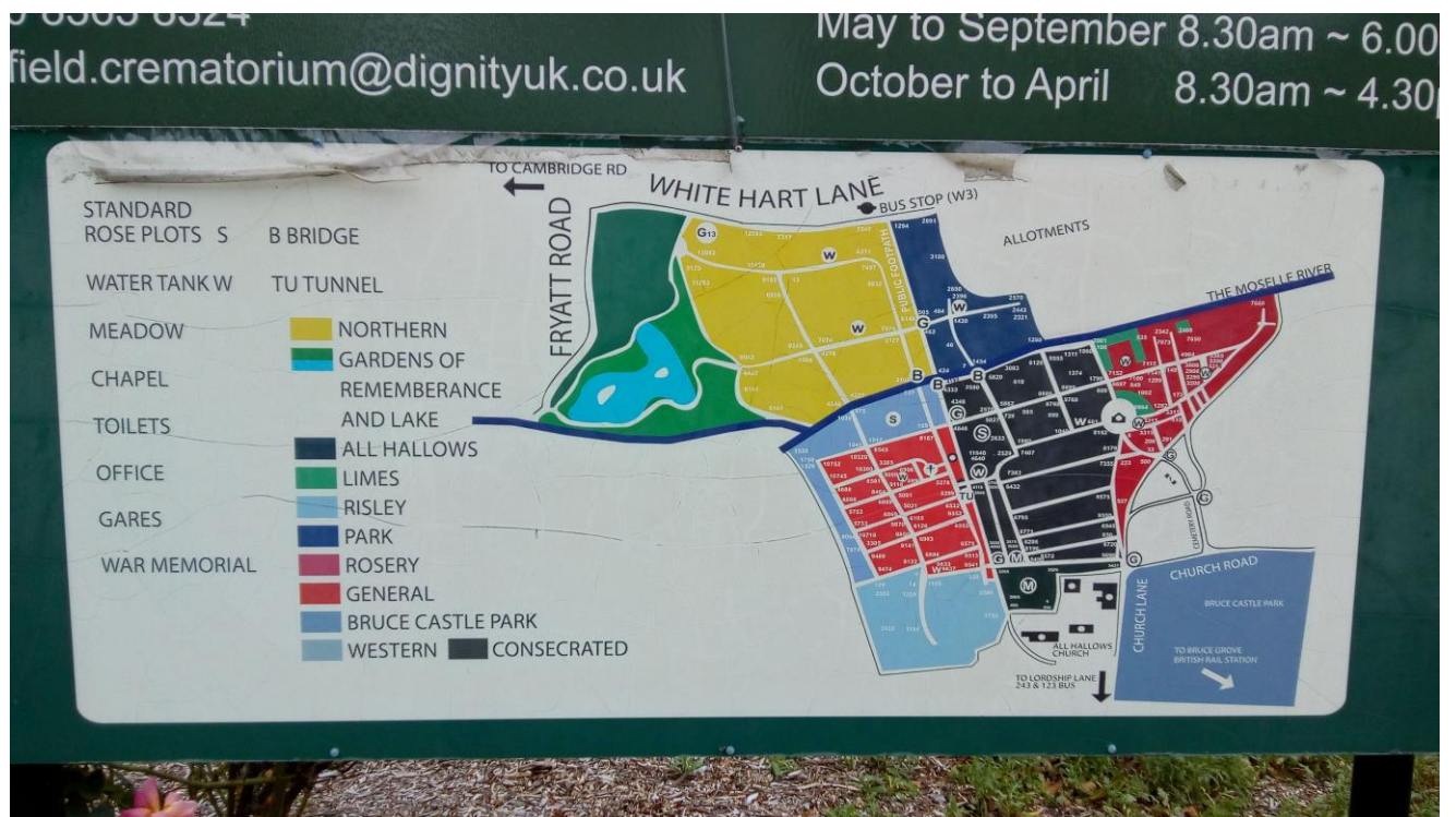
Tottenham Cemetery Map