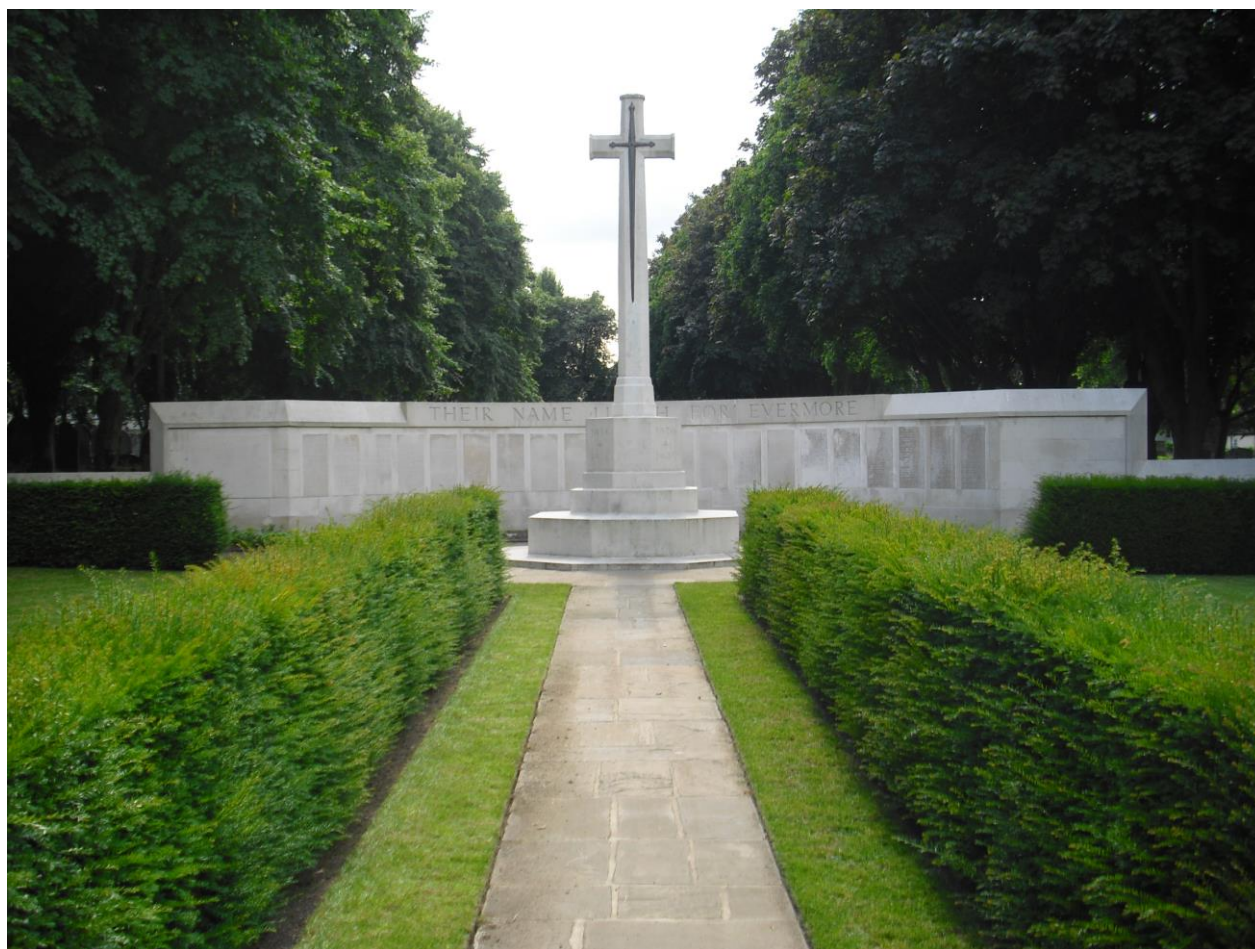
Tottenham Cemetery